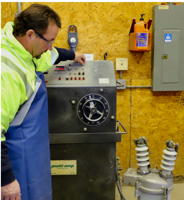
Testing a refurbished OCR.

"The annual OCR project is imperative to make sure our breakers are working properly," Berg concluded. "This not only protects the system from fault current but also, and most importantly, provides safety to our member-consumers."