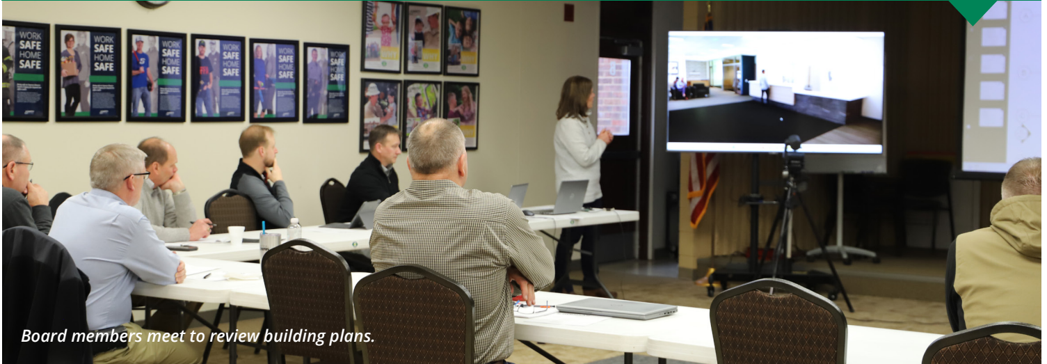
Board members meet to review building plans.