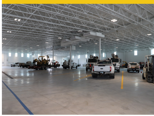
large warehouse provides ample storage

with architect and construction manager to ensure budget, timeline and expectations aligned