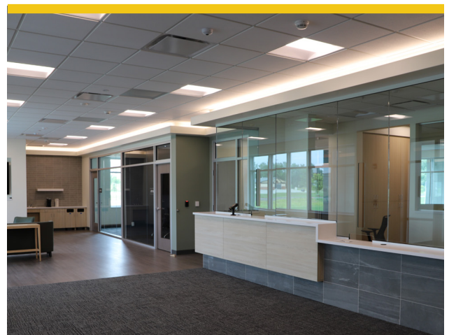
new lobby to welcome members and guests